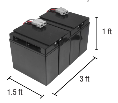
(The image above is only illustrative, not representative of the actual application.)

Automotive lithium-ion battery enclosure.